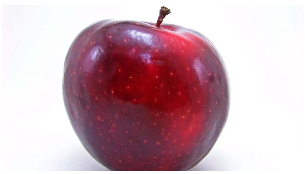
Figure 3. Picture of a real red apple.