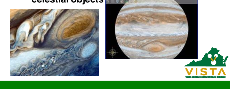
Figure 1. Presentation slide showing an example of hands-on science.

Using a computer to analyze images of celestial objects